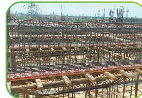
Olive Tree International School