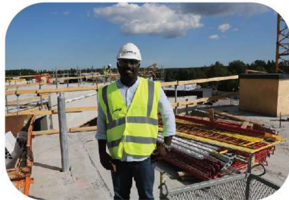
FINLAND VISIT PRECAST CONSTRUCTION SITE