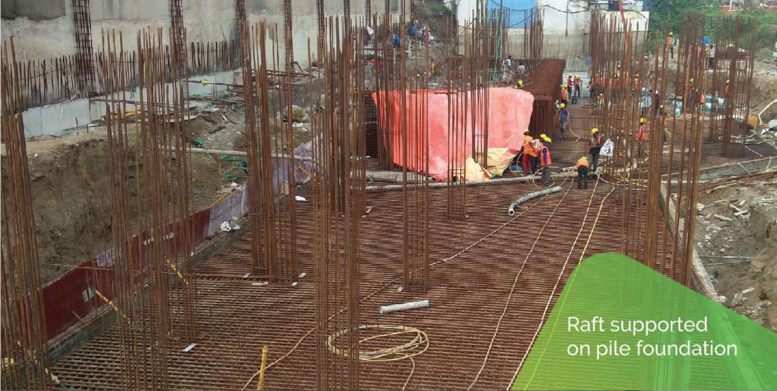
Raft supported on pile foundation