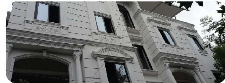
Residential building at Anna Nagar