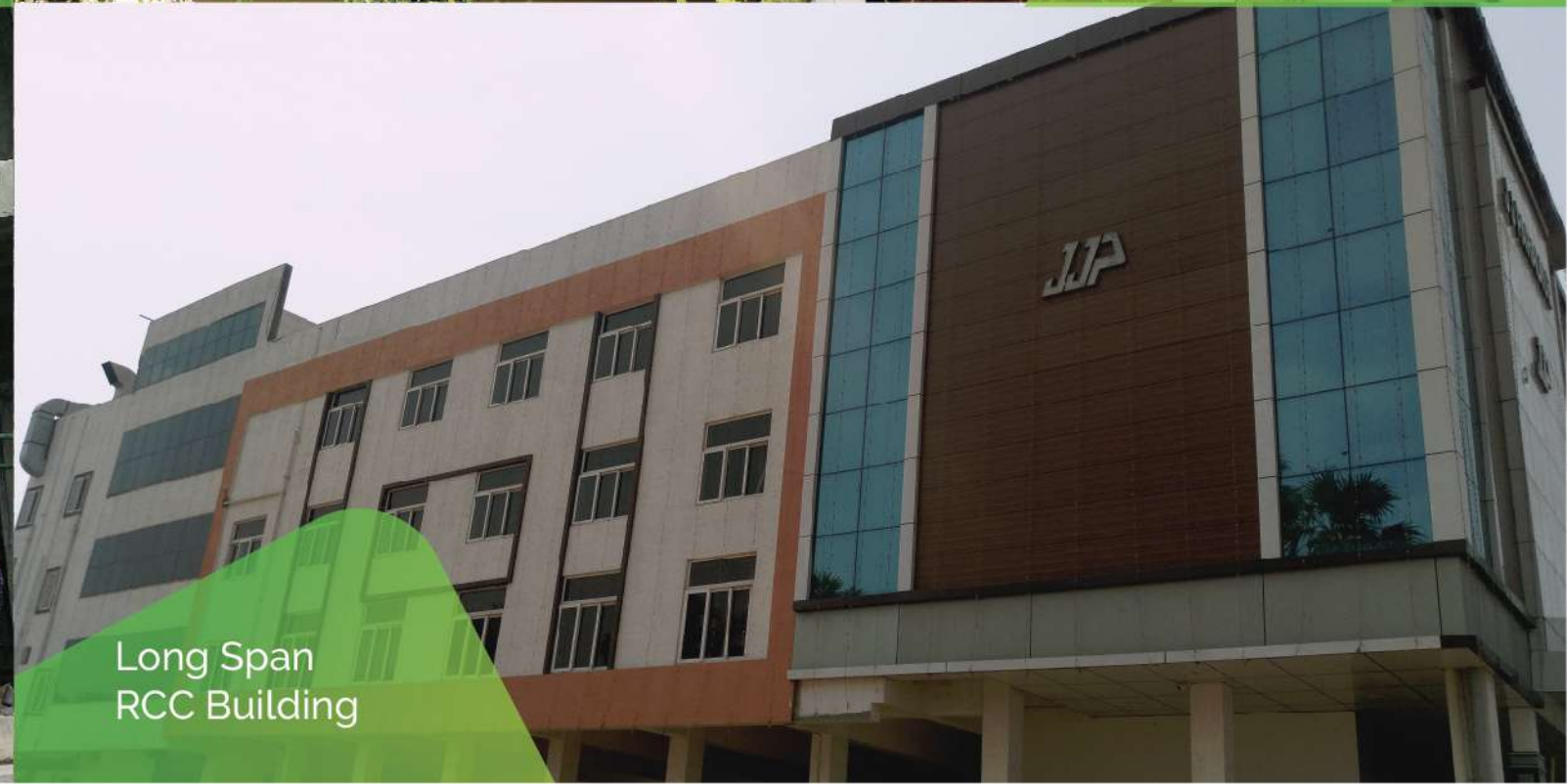
Long Span RCC Building