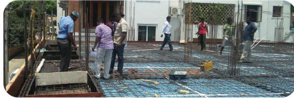
Hospital building in Chennai