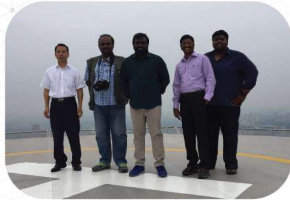
VISIT TO BROAD GROUP, CHINA

A highly motivated and talented team is behind the success at Jacob Engineers. We take part in various events in INDIA and Abroad.