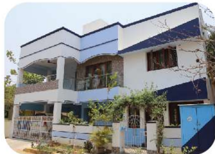
Residence at Selaiyur