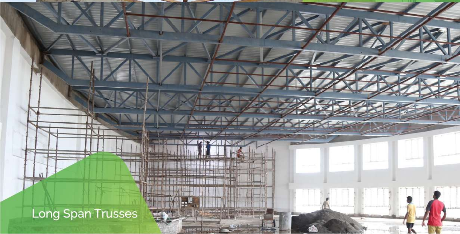
Long Span Trusses