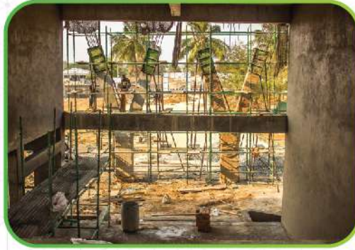
Y Shaped Column