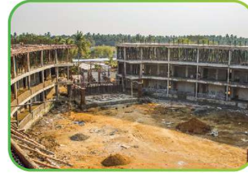
Open Courtyard (Back Side)