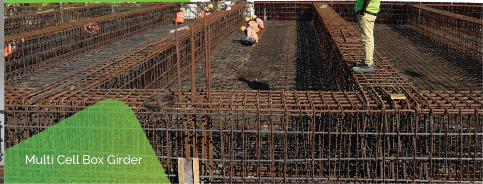
Multi Cell Box Girder