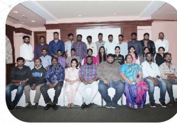
JACOB ENGINEERS ANNUAL FUNCTION