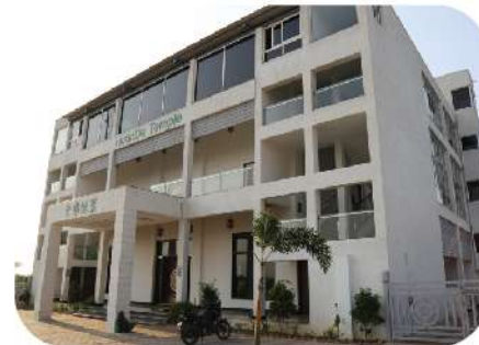
Retrofitting at ECR