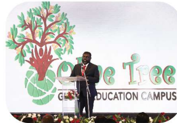
OLIVE TREE SCHOOL INAUGURATION