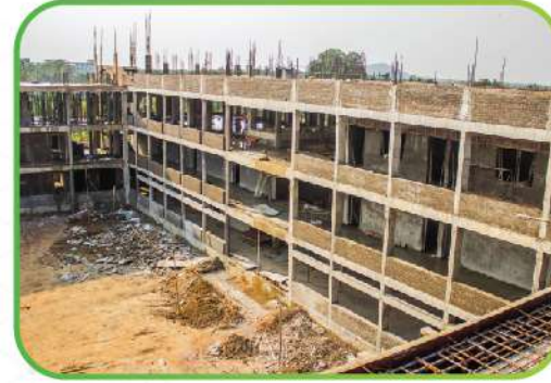
Open Courtyard (Front Side)