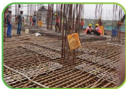
Shear Struts for Punching Shear