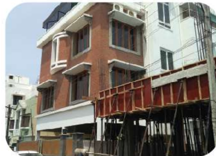
Residence at Tambaram