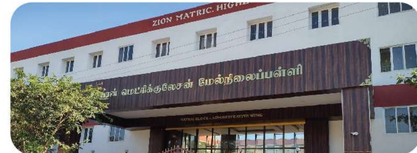
Admin block, Zion school