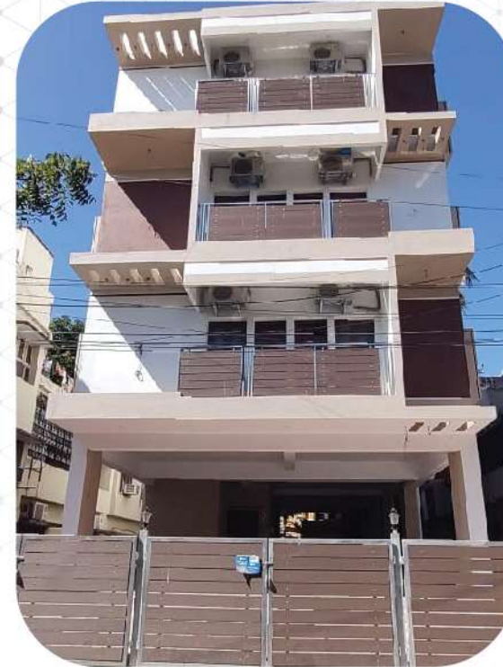
Residential building at KK Nagar