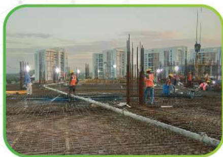
Transfer slab for floating column

Office Building with Column Free Work Area