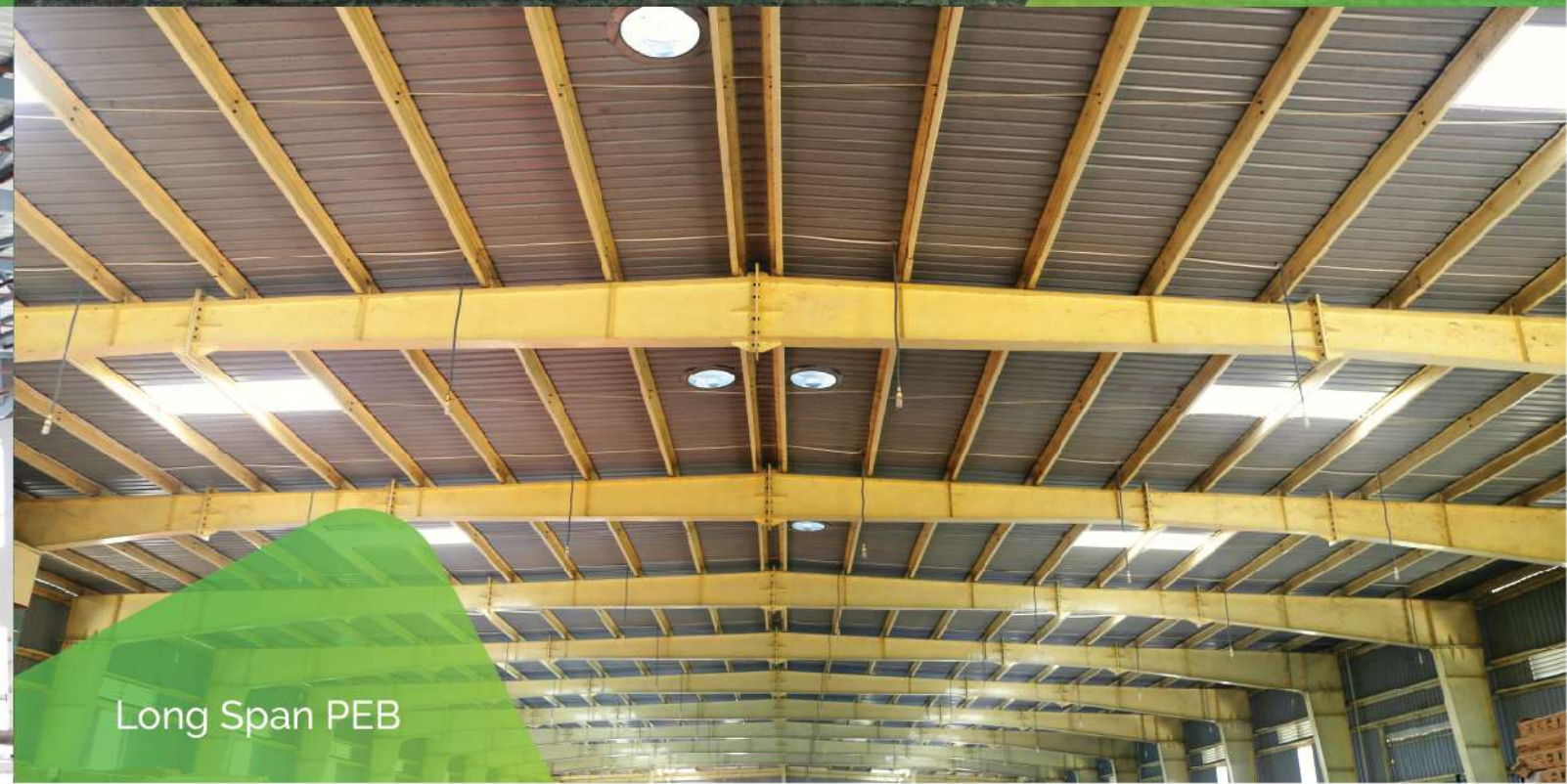
Long Span PEB