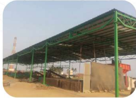
Industrial Building at Chennai