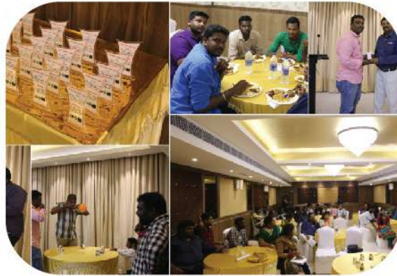
JACOB ENGINEERS ANNUAL CONVENTION