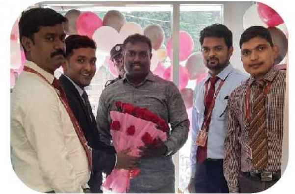
INDUSLAND BANK INAUGURATION