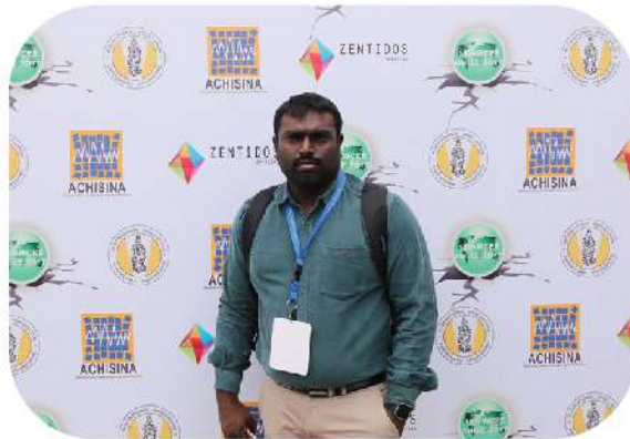
WCEE, SANTIAGO, CHILE