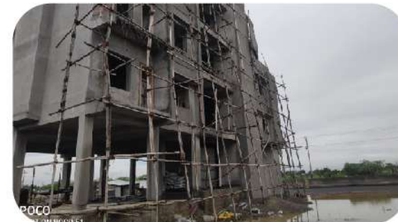
Residential building at Guduvancherry