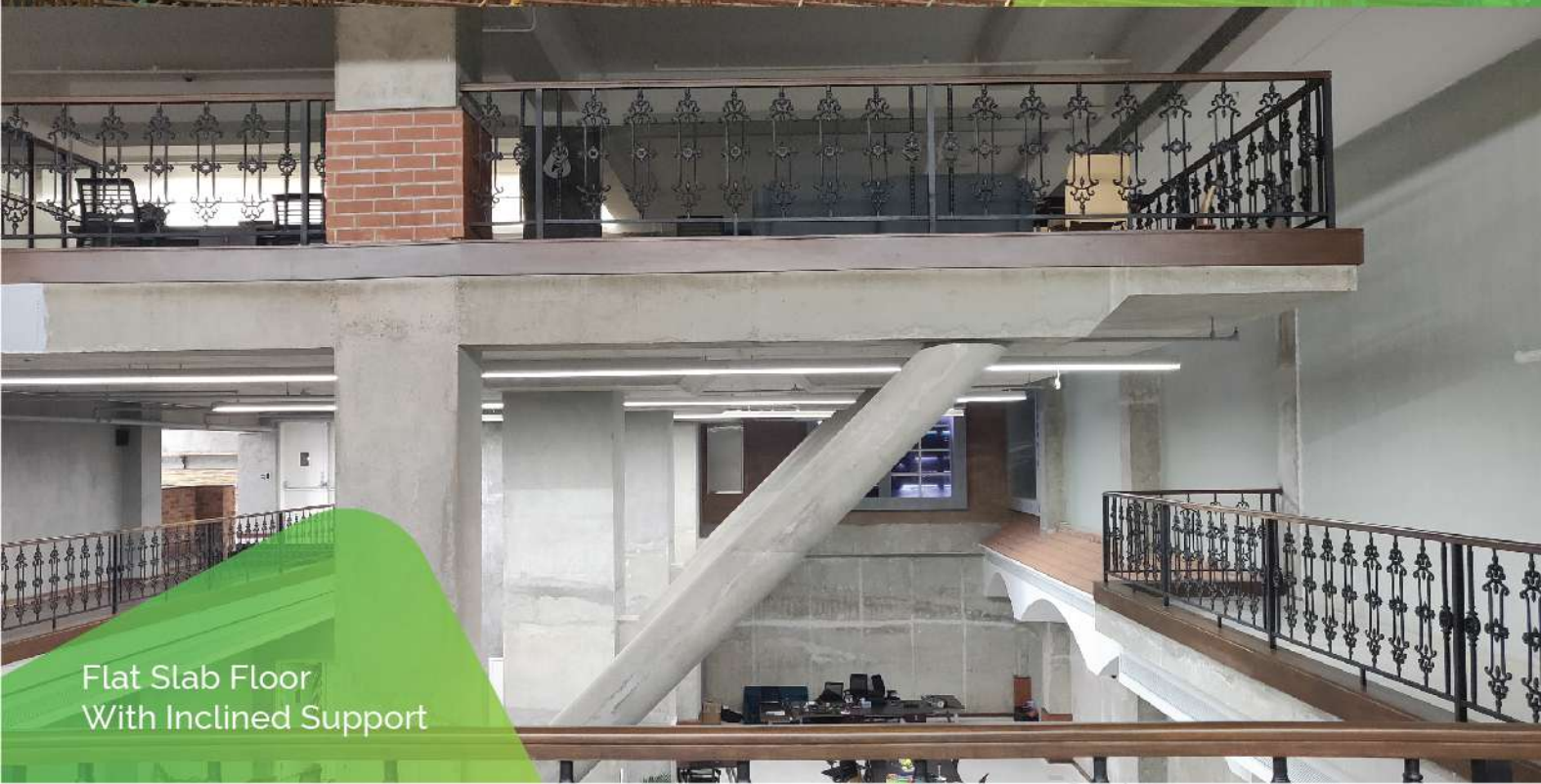
Flat Slab Floor With Inclined Support